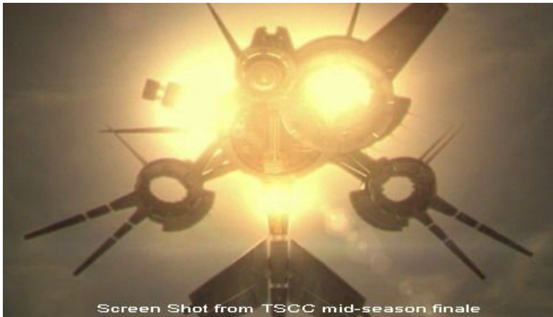
Screen Shot from TSCC mid-season finale